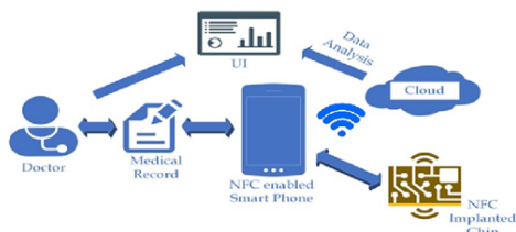
Fig 2 - Our Proposed System

This system is proposed as an android application to enable the doctors to manage patients medical record using smartphones. The model consists of 3 main parts: